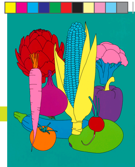
Image: Michael Craig-Martin; Domesticated Nature: Vegetables, 2022

Free exhibition tour, Thursdays 1.30-2.00pm